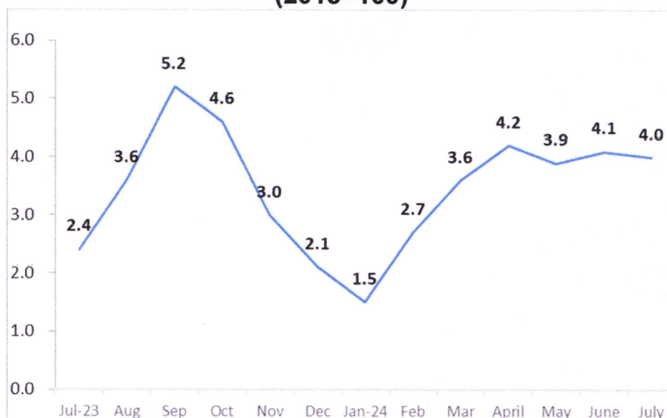
Figure 2. Inflation Rates in Baguio City, All Items (2018=100)