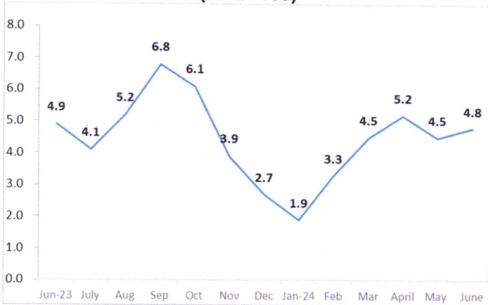
Figure 2. Inflation Rates in Baguio City, All Items (2018=100)