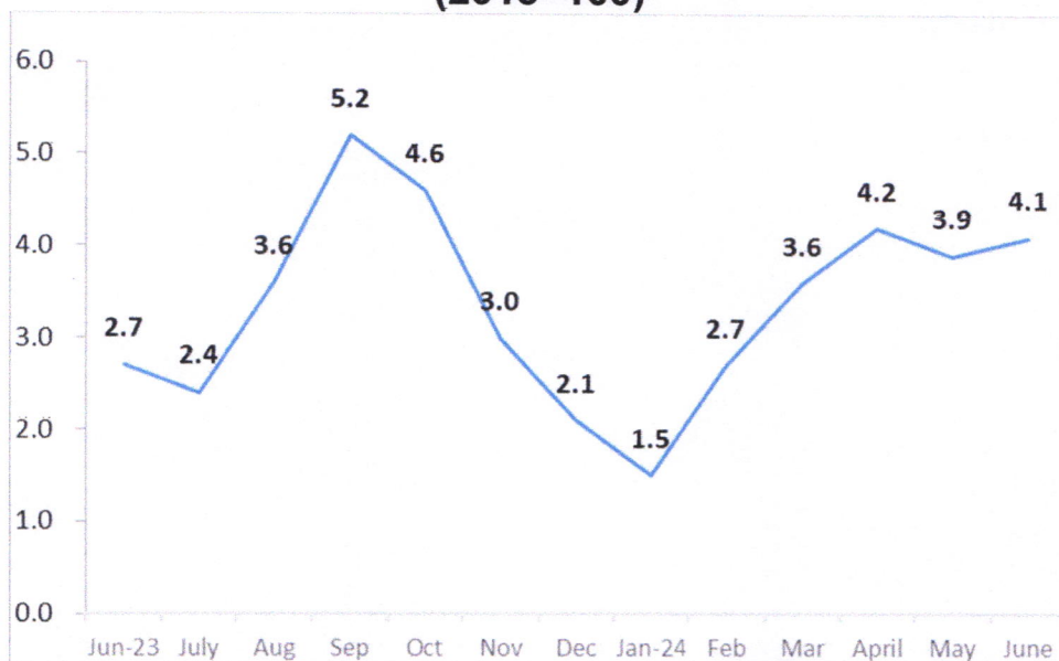
Figure 2. Inflation Rates in Baguio City, All Items (2018=100)

Source: Retail Price Survey of Commodities for the Generation of Consumer Price Index, Philippine Statistics Authority