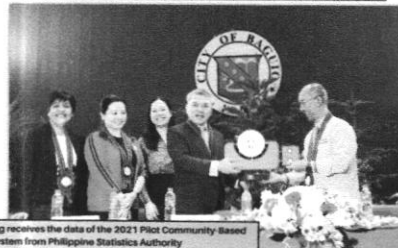
Mayor Benjamin B. Magalong receives the data of the 2021 Pilot Community-Based Monitoring System from Philippine Statistics Authority