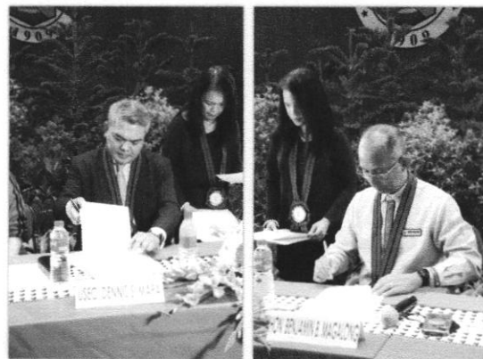
Mayor Benjamin B. Magalong and Usec. Claire Dennis S. Mapa sign the Data Turnover Agreement of the 2021 Pilot Community-Based Monitoring System