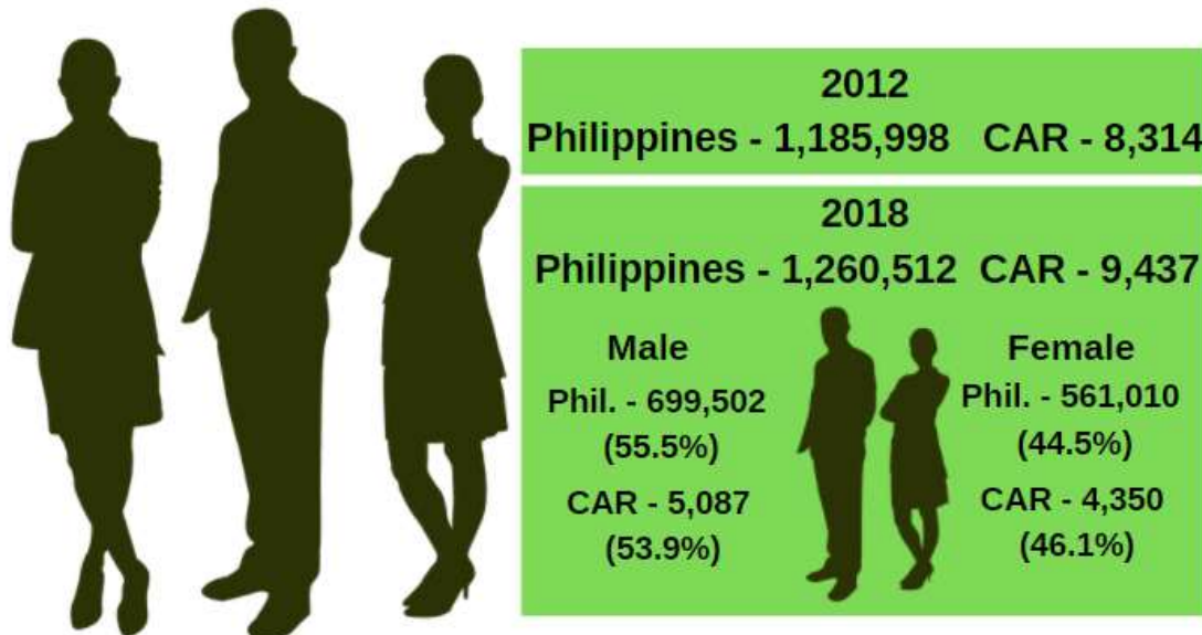
Figure 2. Number of Employees of Manufacturing Establishments: Philippines & CAR, CY 2012 & 2018