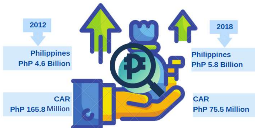
Figure 3. Total Revenue of Manufacturing Establishments, Philippines & CAR: 2018